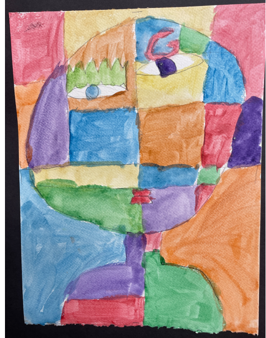
Middle School Art: Integrated Language Arts and Social Studies student work in the style of Paul Klee.